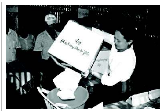
Teacher demonstrates as polling staff in Mon State